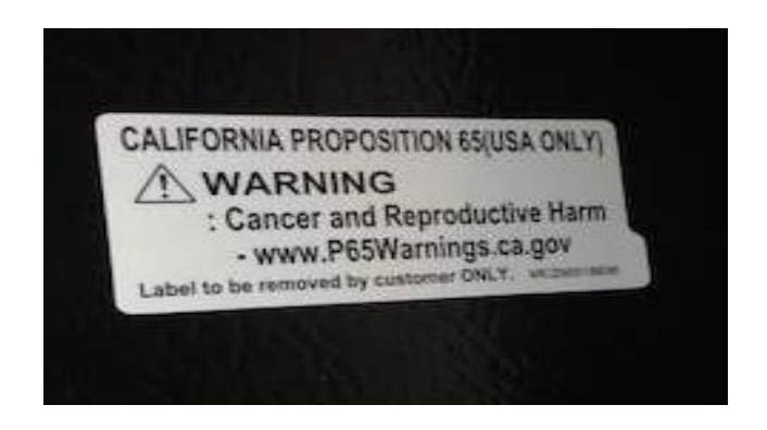
Refrigerator - On-Product Label