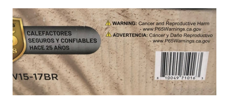
Ceramic Tower Heater – On-Product Label