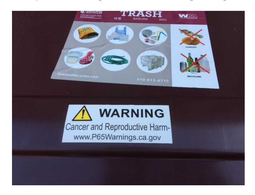
Residential Trash Bin Warning