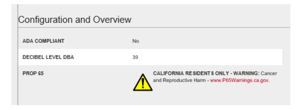
Dishwasher - Website Warning