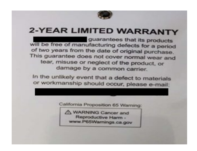
Luggage – On-Product Label