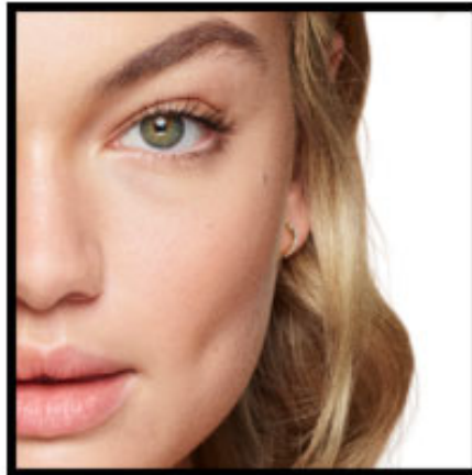
12 13 14 SILKY SMOOTH FORMULA Special skin-brightening pigments help minimize the appearance of imperfections

2 7. Even more disconcerting, Defendants' advertising shows the Product 3 employed directly on the face as set out below, despite research that shows that 4 exposure near the eyes and mouth increases the likelihood and hence risk of absorption 5 and ingestion. 10